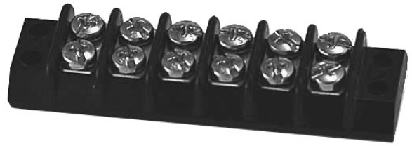
106 / 670A GP 06